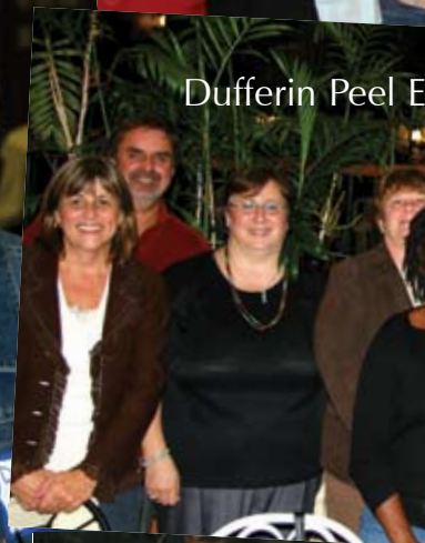
Dufferin Peel E