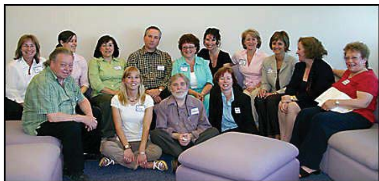
APSSP Niagara Chapter Executive Members